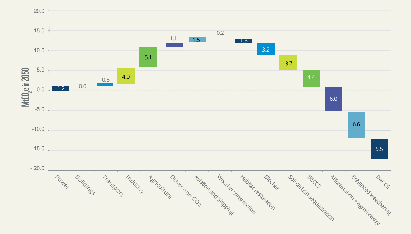
FIGURE 1. SCOTLAND'S Emissions in 2050

Scotland plays a pivotal role for the wider UK to be able to achieve net zero GHG emissions. Given its large land availability, Scotland has relatively more opportunity to deploy GGR options compared to the rest of the UK. By 2050, Scotland could produce around 17 MtCO2 of net negative emissions, allowing the whole of the UK to reach net zero by 2050.